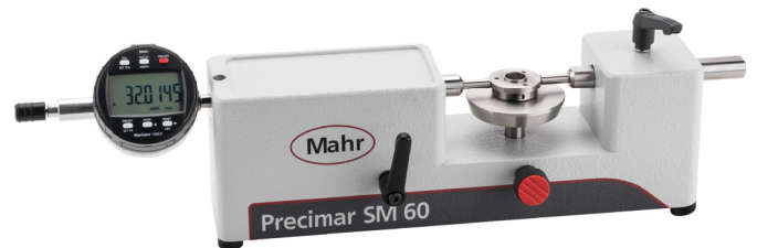
Shown with optional MarCator 1086