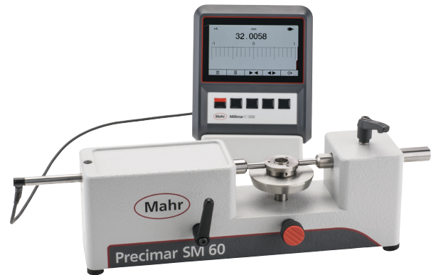
Shown with optional C 1200 and P 2004 M